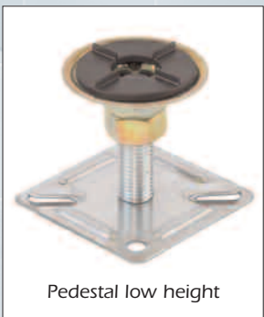
Pedestal low height