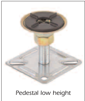
Pedestal low height