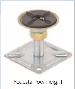
Pedestal low height